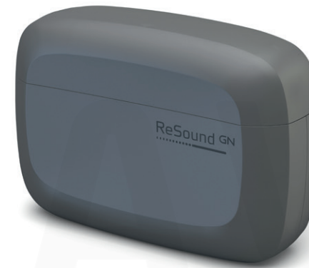
Premium charger C-1