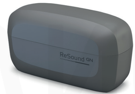
Standard charger C-2